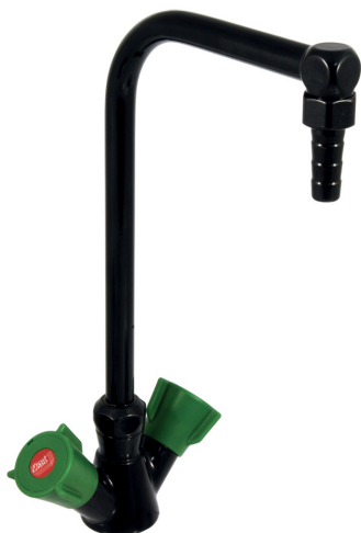
Table top twin tap with swivel spout - 76052