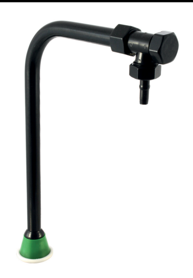
Table column with fixed spout - 76100