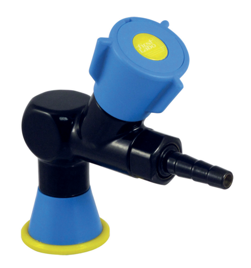
Table top tap for cement bench - 76161