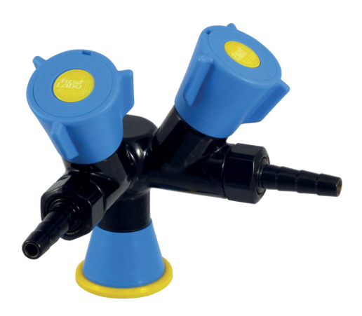
Table top dual taps at 90 ° - 76163