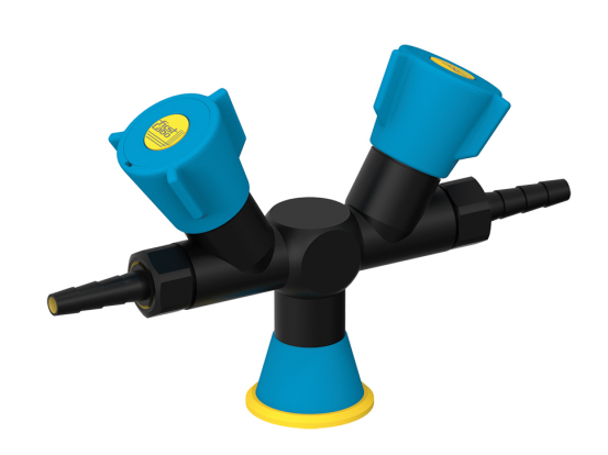
Table top dual taps at 180° - 76164