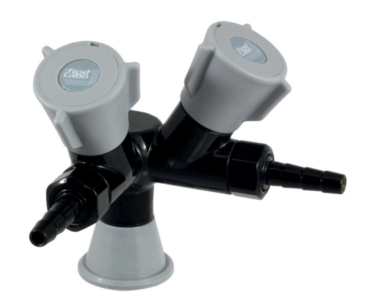
Table top dual taps at 90 ° - 76179