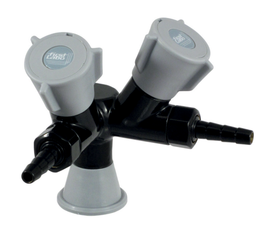
Table top dual taps at 180° - 76180