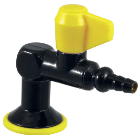
Table top single tap - 76195