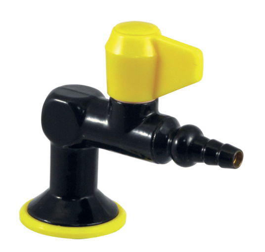
Table top single tap - 76212