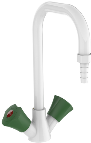
Table top twin tap - Projection 150 mm fixed and swivel spout, with removable nozzle - 76792