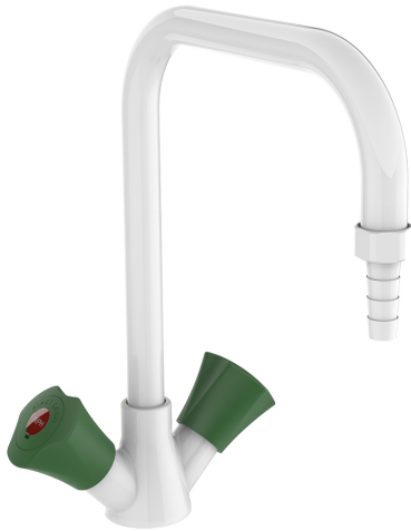
Table top twin tap - Projection 200 mm fixed and swivel spout, with removable nozzle - 76794