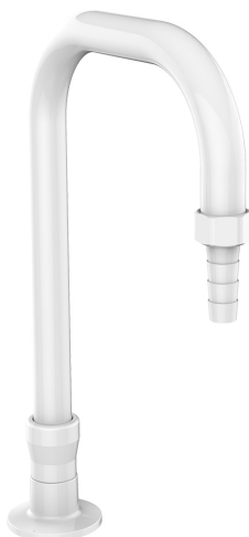
Table column, projection 150 mm, with fixed and swivel spout, with removable nozzle - 76798